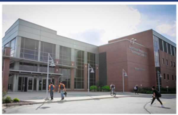
Green Bay Campus