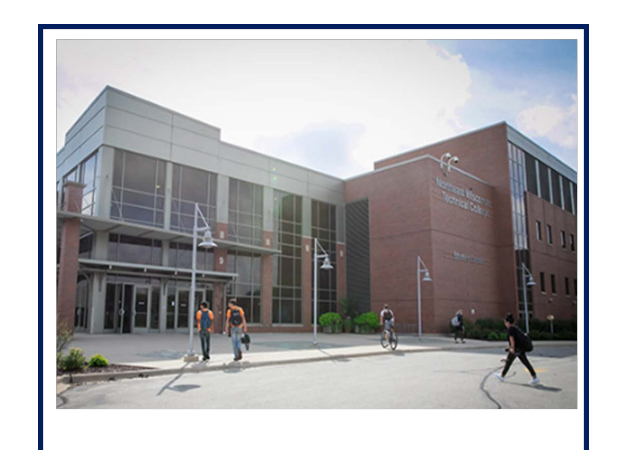
Green Bay Campus