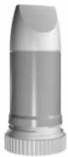
PULMICORT Flexhaler® “breath Activated Device”

Prime every new Flexhaler® by twisting bottom back and forth twice before following steps 1-7.