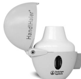
SPIRIVA comes in a Handihaler® A once a day medication