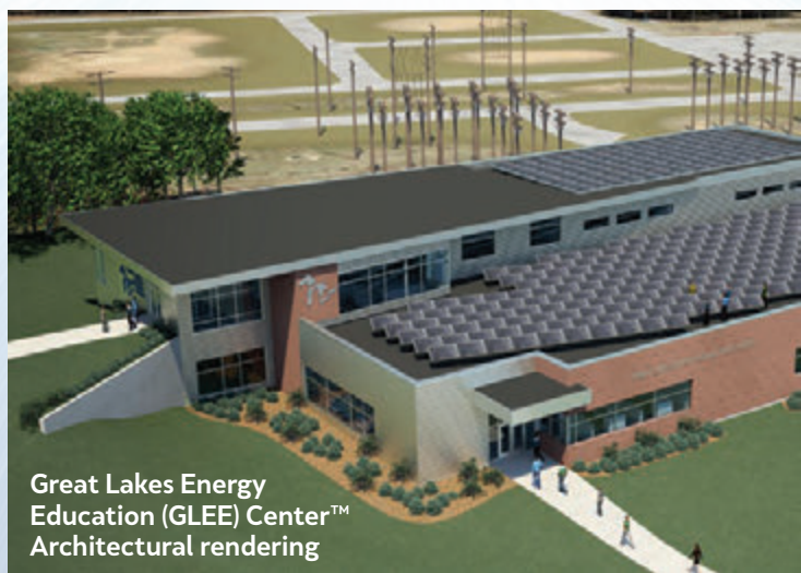
Great Lakes Energy Education (GLEE) Center™ Architectural rendering

Facility naming opportunities and multi-year pledges offered.