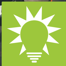
Utilities Engineering Technology