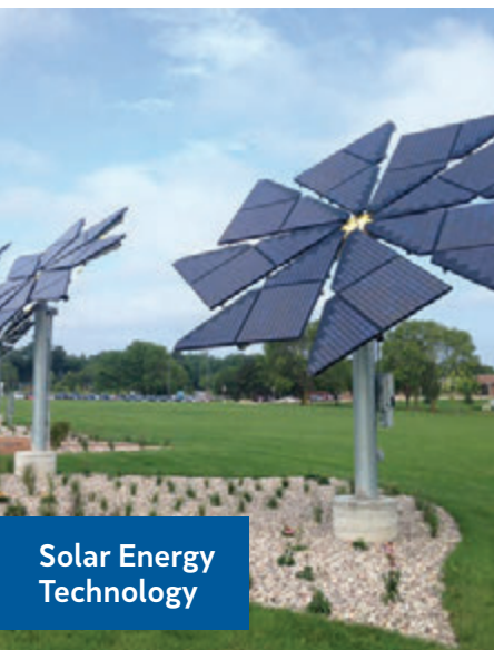
Solar Energy Technology