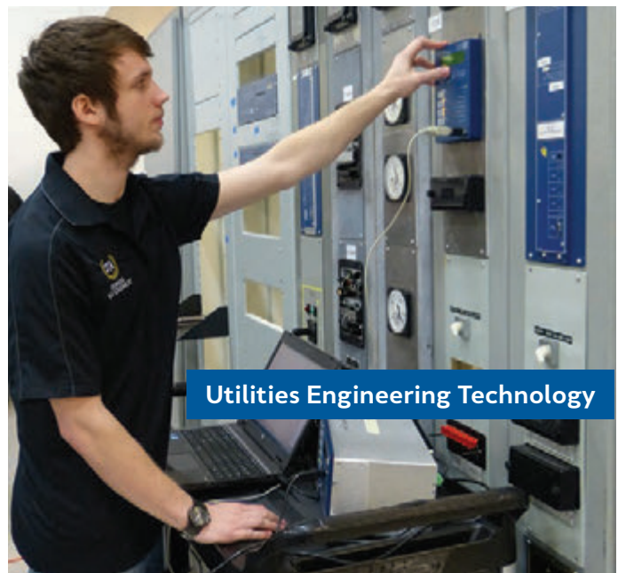
Utilities Engineering Technology