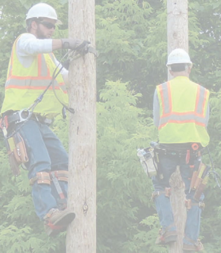
Electrical Power Distribution