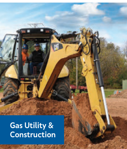
Gas Utility & Construction