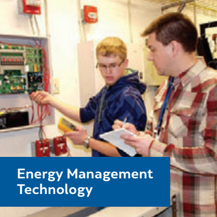
Energy Management Technology